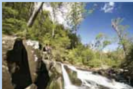
Barrington Tops Attraction / Activities

Beneath the World Heritage-listed Barrington Tops you'll find 10 luxury cedar cottages, all with open fires and spa baths, horse-riding, bushwalking and bird-watching plus first class service and friendly country hospitality. Advanced Eco Tourism Accredited. 384 Jems Creek Road, Cobark Telephone (02) 6558 5544 www.hookescreek.com.au Rates: From $140 per couple per night*