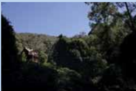
Barrington Tops Accommodation