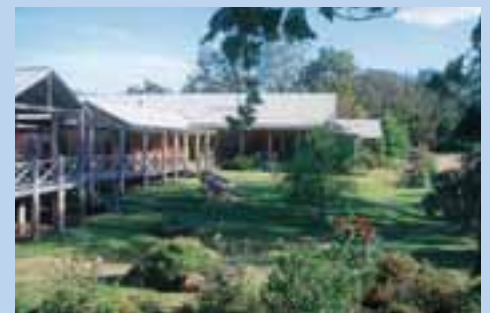
Barrington Tops Accommodation

For accommodation bookings and information about tours and attractions in the World Heritage-listed Barrington Tops National Park. Open 7 days, the centres stock a large range of locally produced arts and crafts. Dungog Visitor Information Centre, Gloucester Visitor Information Centre Telephone 1300 130 647 www.barringtontopstourism.com.au